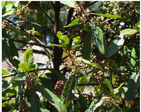
Wild fruits consumed by the Ogiek community

The use of honey in ceremonies was mandatory, and was part of our culture. Honey, honey-wine (Rotikap gomek) and honey-water (Lugumeg) had great symbolic value to us. Without honey, no ceremony would have taken place.