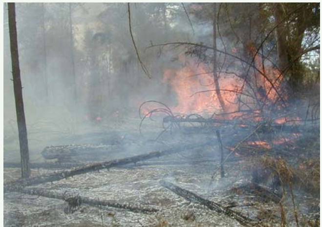
Destruction of Mau forest by wild fires

The remaining gazetted forest is facing a lot of threats, in that the people who are living in the buffer zone encroach the forest, some igniting fires which destroy the habitat of the wild animals and reduce the number of rare species of plants. There is also pollution of the water resources around Mau forest complex. Whilst in the past, water was taken without any effect, today there has been prevalence of water-borne diseases like typhoid posing great threat to us and other communities living around the area.