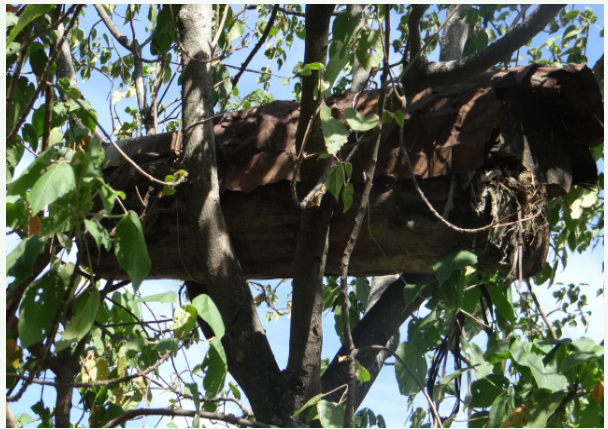
Photograph of a traditional beehive

We can also easily identify bees and their roles in the hives. The Kooburiot or Drones are useful in reproduction and not honey production. The segemiati or worker bees are known to make sweet honey and are very aggressive as they can sting in protection of the hive (as opposed to the drone). When looking for wild honey 2 , an experienced bee-keeper would seek assistance of the honey guide, a bird capable of sensing honey in the forest. The bird would lead