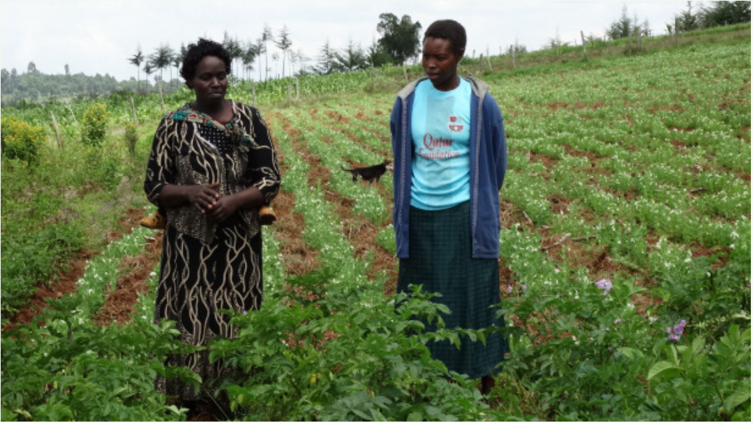
A group of Ogiek Women in Tinet showing how they are practicing Farming as a mean of livelihood