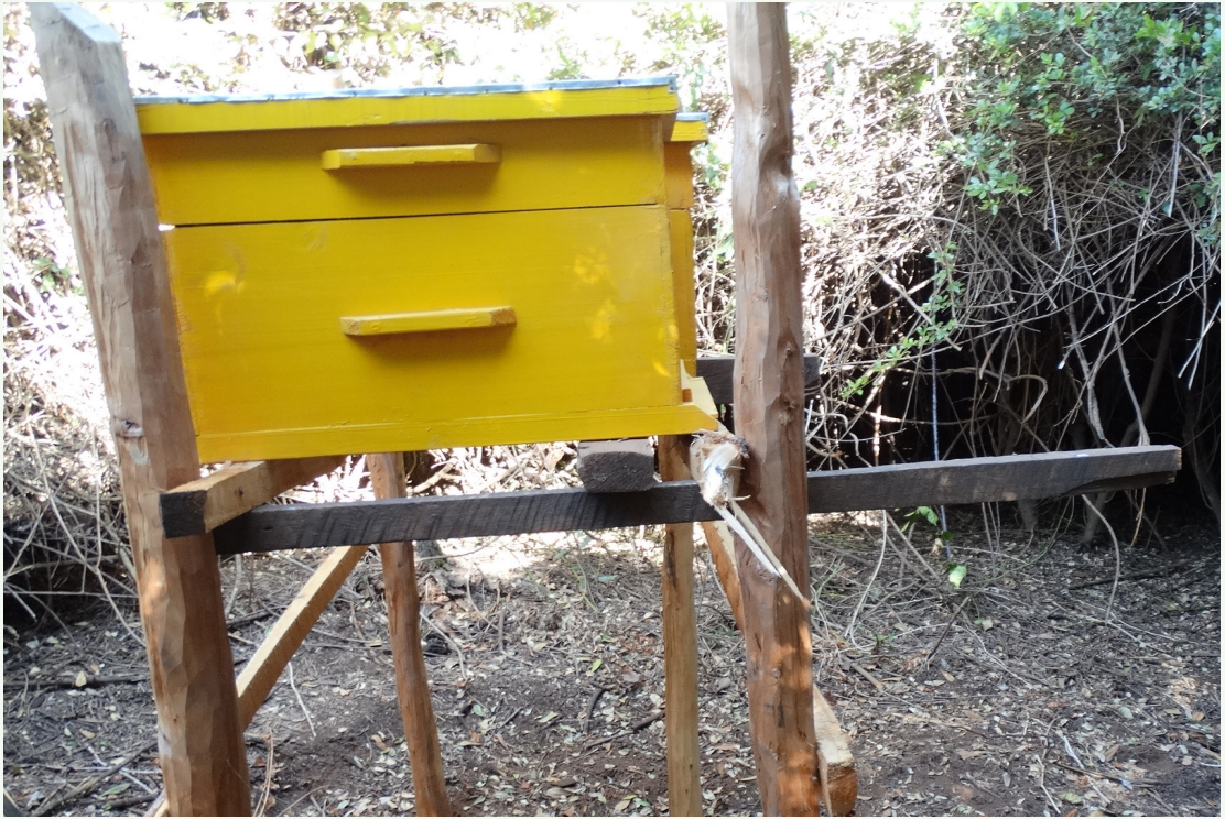
Logoman Self Help Group are using this kind of Modern langstroth hives for bee keeping

We have a wide-range of traditional knowledge on Bee keeping. We are able to identify the honey-making and brooding season for bees. We can tell the difference in honey (color and taste) depending on different seasons and the type of bee forage. We can identify "herbal honey" from medicinal plants, usually for treatment of different ailments and disorders.