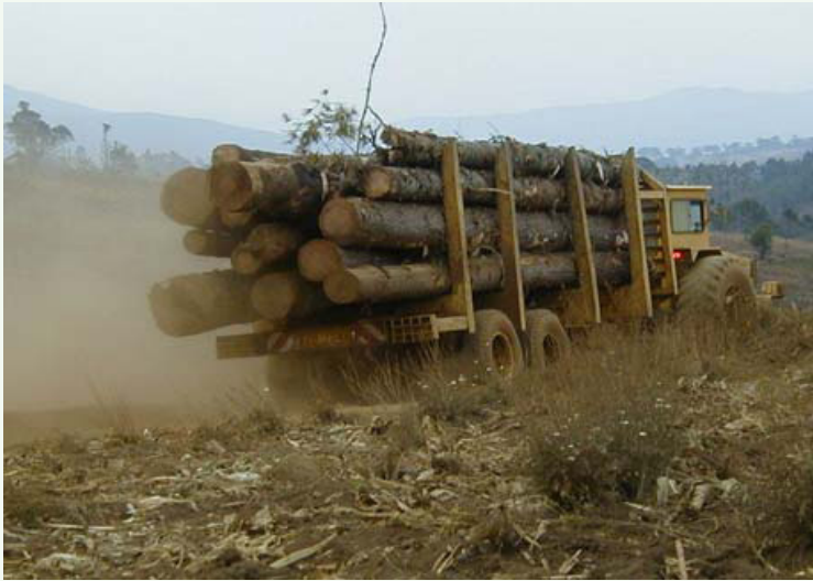
A Multinational Company tractor hauling felled logs from the Mau Forest