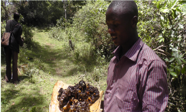
An Ogiek man showing honey harvested from stingless bee nest

the hunter to the direction where there is wild honey. The hunter would then harvest the honey and give some to the bird. This symbiotic relationship with this bird has been in existence for centuries, and it is our traditional way of honey harvesting.