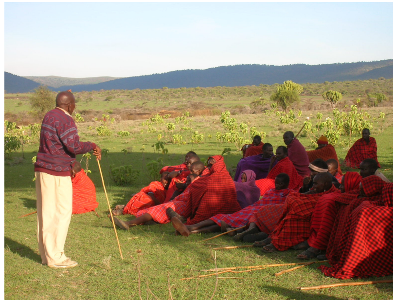
Figure 1. Maasai pastoralists in northern Tanzania are dispossessed from their customary lands for private hunting concessions and state protected areas.

The 1998 Wildlife Policy of Tanzania described the future management paradigm for wildlife in Tanzania as one that would devolve rights to use and benefit from wildlife outside the core protected areas (national parks and game reserves) to local communities living alongside wildlife, with the aim of making wildlife a beneficial and competitive local form of land use. 26 This policy recognized that for wildlife to be sustained outside state protected areas, local communities needed to capture more direct benefits from wildlife. The core mechanism for achieving this is through establishment of Wildlife Management Areas, where local communities would, according to the 1998 policy, be given "full mandate" of using and benefitting from wildlife. 27 After the release of the 1998 policy, expectations were that a new law would be passed to replace the 1974 Wildlife Conservation Act and give legal meaning to the new policy and that this law would accordingly devolve greater rights to villagers. 28